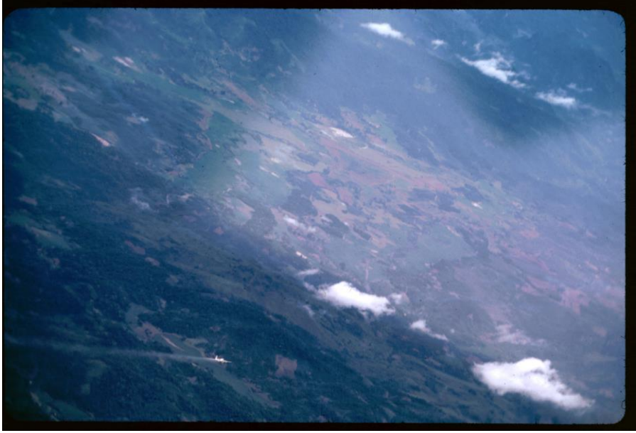
RAYGUN THREE decending streaming fuel Photo by Ken Van Lue

SAM exploding - right of RAYGUN SIX Photo by Ken Van Lue I pushed forward on the stick to keep from stalling and watched as RAYGUN THREE (Red and Kelly) gradually banked to the left and began to descend. At first, I thought that they were okay and just gathering their senses, but in a few seconds we saw that they were on fire, and observed a stream of grey fuel coming from their starboard wing next to the fuselage.